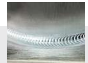
Welding aluminum and alloys

High-speed welding with anti-interference capability