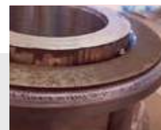
Heavy construction equipment